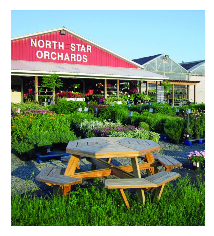
North Star Orchards in Westmoreland.

27. West Elmira (suburb) - Chemung County Median household income:$81,475 Households: 2,175