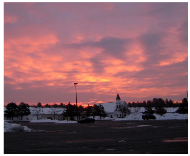
Sunrise in Country Knolls.