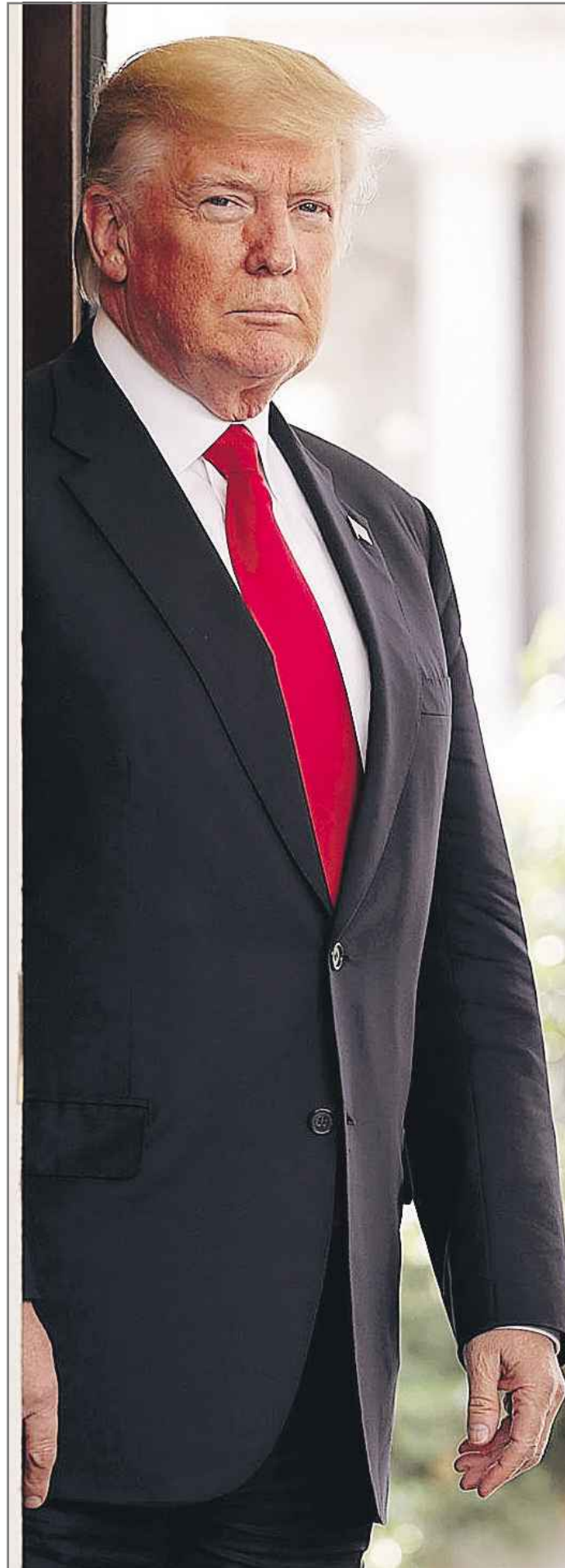
President Donald Trump yesterday. ■ Video: newsday.com/nation